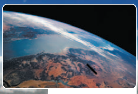
High clouds show the location of the jet stream in this satellite image.

Click on Math Tutorial for more help with adding measures of time.